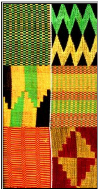
West African Kente Cloth